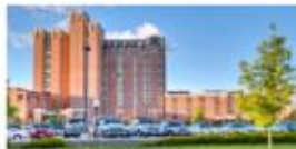
St. Luke's Boise