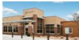
St. Luke's Elmore