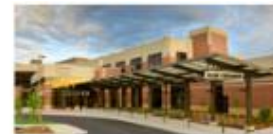
St. Luke's Magic Valley