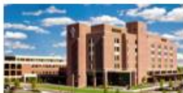
St. Luke's Meridian