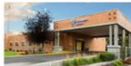
St. Luke's Jerome