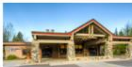
St. Luke's McCall