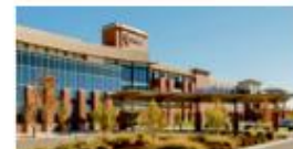
St. Luke's Nampa